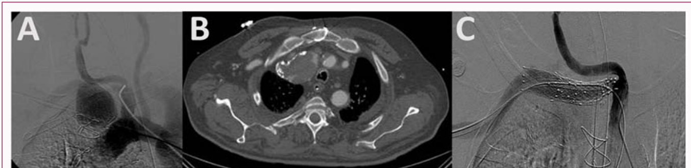
Figure 1: A). Large pseudoaneurysm arising from right subclavian artery demonstrated by conventional angiography and after treatment: B). As seen in CTA and C). As seen in conventional angiography.

Any significant bleeding following tracheostomy, either immediate or delayed is a potential life-threatening complication. Peak incidence and the risk for bleeding are found during the first 6 weeks after surgery [6]. Most of delayed postoperative bleedings are the result of TIAF and in more than 50% of cases, a sentinel bleeding occurs. Risk factors associated with an increased risk for TIAF are low tracheal ring incisions (lower than 3 rd ring), which lead to cannula-induced constant arterial pressure, surgical site infection and overinflated cuff that can cause pressure necrosis to the tracheal wall [6]. Following angiography, all three patients survived the procedures, without re-interventions. No neurological sequela was