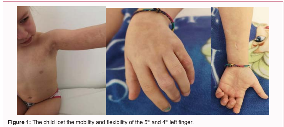
Figure 1: The child lost the mobility and flexibility of the 5 th and 4 th left finger.

Copyright © 2022 Alice Azoicai. This is an open access article distributed under the Creative Commons Attribution License, which permits unrestricted use, distribution, and reproduction in any medium, provided the original work is properly cited.