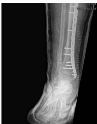
Figure 8: Medial distal tibial plate LCP 3.5.

anterior flexion and 20° of valgus. Our clinical case had a much larger deformity.