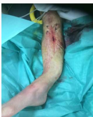
Figure 2: Irreducible deformity of the right leg at 45°.