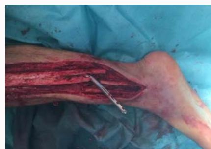
Figure 5: Nail retrograde way.