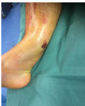
Figure 1: Irreducible deformity of the right leg.