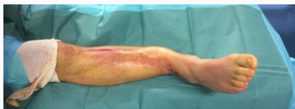
Figure 3: Irreducible deformity of the right leg at 45° lateral flexion.

With regard to osteosynthesis, we have been able to perform a conventional osteosynthesis by medial distal tibial plate LCP 3.5 (Figure 7,8).