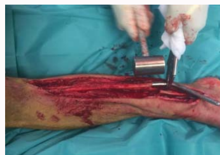
Figure 6: Anteromedial approach with a distal tibial corticotomy flap.