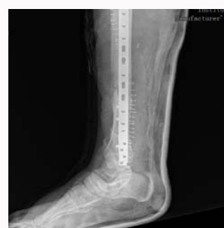
Figure 7: Conventional osteosynthesis.

by standard route [8]. By carefully studying the deformations, one realizes that these were not important and finally allowed a classic extraction of the nail. One case reported by these authors had 13° of