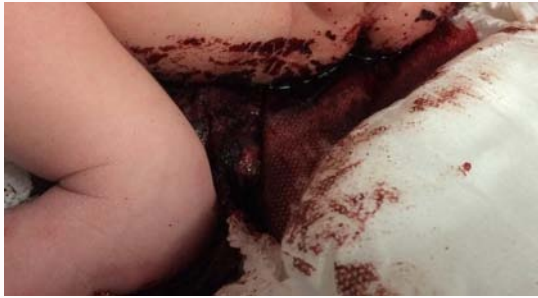
Figure 1: Bloody stool passage from first minute.