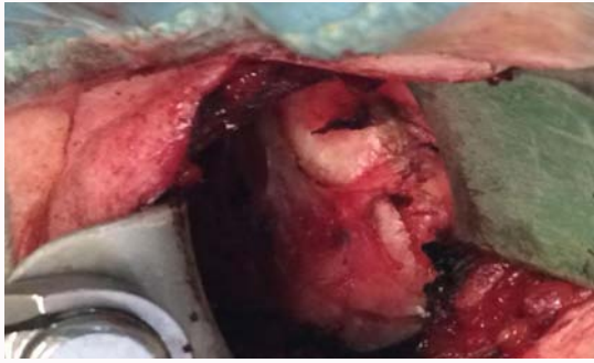
Figure 1: Sagittal CT scan showing cervical anterior osteophytes from C3 to C6.