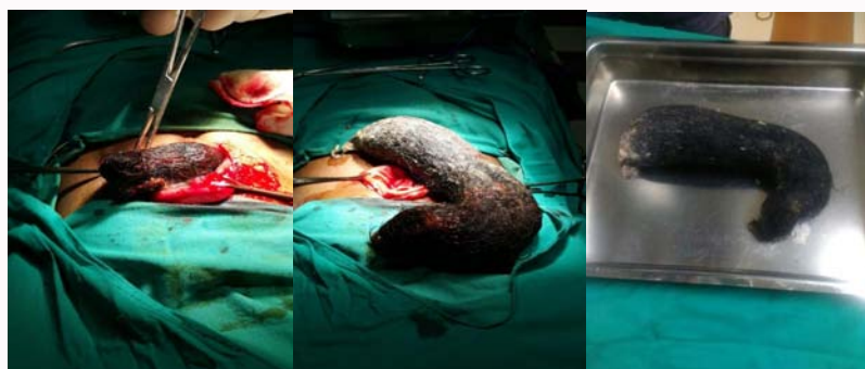
Figure 2: After laprotomy, removal of stomach like trichobezoars.

This is an open access article distributed under the Creative Commons Attribution License, which permits unrestricted use, distribution, and reproduction in any medium, provided the original work is properly cited.