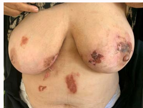
Figure 3: Erosive and pigmented lesions of the breast in the context of pathomimia.