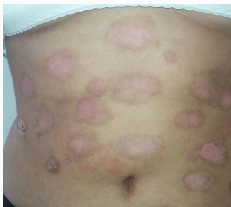
Figure 1: Geometric lesions with well-defined edges of dyschromic scars in the abdomen resulting from excessive deodorant application.