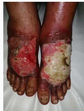
Figure 4: Well-limited ulcerated and fibrinous lesions on the dorsal surface of both feet.

in 4 patients (12.5%) and personality disorders in 3 patients (9.4%).