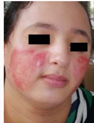
Figure 2: Erythematous lesions and well-limited erosions of the cheeks.