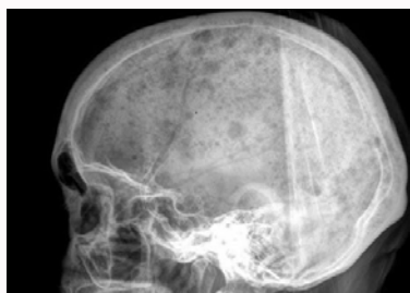
Figure 2: Skull X-ray (sagittal view) showing a raindrop skull, typical of myeloma.