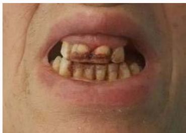
Figure 1: Gum bleeding in a patient with HVS.