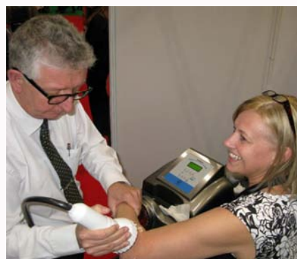
Figure 6: CellSonic treatment for tennis elbow.

I said to the doctor that he had shifted from cancer to plastic