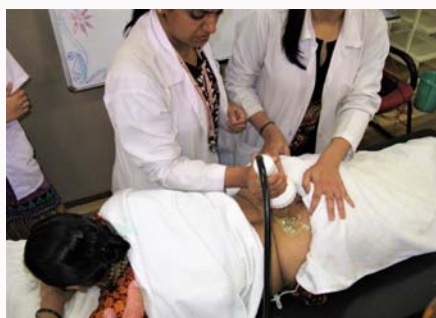
Figure 7: Lower back pain.

provoke. This is a simplification because the complete explanation is complicated. Damage is done to infection, germs are killed, calcifications shattered and blockages released. Provocation is the stimulation of the immune system to make a repair by bringing stem cells to the site, increasing vascularisation and blood cells. Muscles are enhanced and nerves repaired. Additionally, and very simply, the replication of mutant cells is stopped and they then only replicate healthy cells. In other words, cancer is stopped without drugs, non-invasively and without side effects.