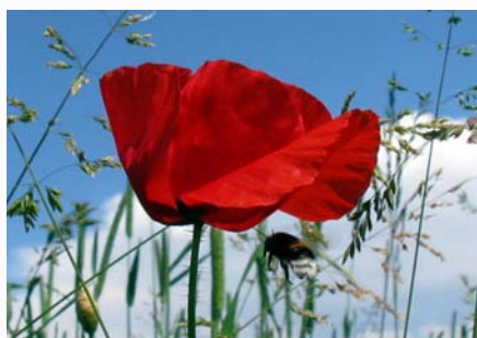
Figure 1: Photo of poppy and bee by the author.

Britain had used it to profit from China by forcefully cultivating poppies in India and militarily pushing them on the Chinese [3]. By 1840 there were 10 million Chinese opium addicts; largely due to illegal British imports. Sales were sustained by the users' addiction.