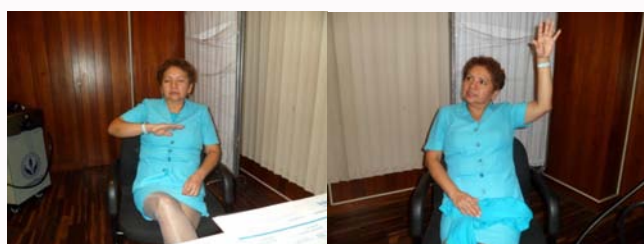
Figure 5: The lady could not lift her arm. Fifteen minutes after a five-minute treatment with CellSonic she could.

cancer does. It is the pain from cancer that often alerts the patient. Medical advice is to be checked regularly for cancer and if it can be caught early it can be removed. Maybe it can be by selective poisoning of the cancer cells or by targeting with radiation, both methods with side effects. The chemo-radiation cure rate varies from low to dismal.