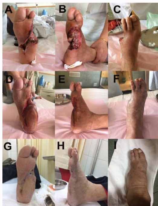
Figure 5A-5I: Follow-up of the surgical intervention and outcomes.

tissue in the lateral 5 th humerus bone was confirmed as an infectious submerged cavity (Figure 3). The first incision performed at the bedside resulted in limited purulent exudation, as well as decreased local tension and reduced foot swelling. However, progressive necrosis of the skin margin was noted (Figure 2A, 2B).