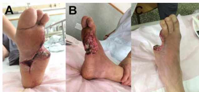
Figure 4: Results of patella truncation and debridement.

The Magnetic Resonance Imaging (MRI) of the foot obtained on July 14 th is shown in Figure 1F, 1G. Subcutaneous inflammatory