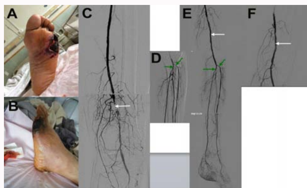
Figure 2A-2F: Administration of first therapeutic intervention.