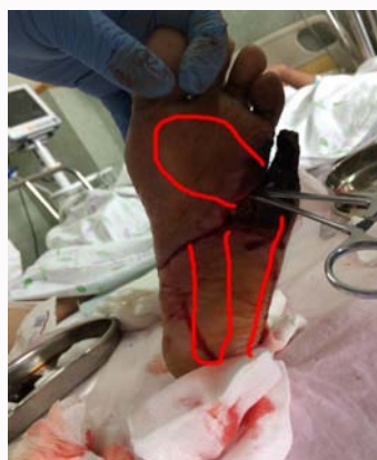
Figure 3: Subcavities found in the left foot.

normal. The muscles of the left foot had clearly atrophied; the skin was thin, bright, and hypertonic. Incision and drainage (approx. 5.0 cm long) was immediately performed between the 4 th and 5 th toes. Necrotic tissue, minimal purulent exudation, and limited bleeding were observed.