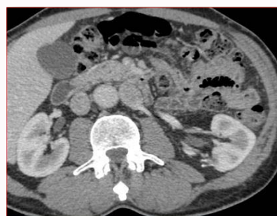
Figure 4: A CT image. Post-surgical changes on the left kidney with no signs of recurrence can be appreciated.

esophagus, vulva, vagina, anorectal region, penis, and skin. It is very unusual in the urinary tract [1,2]. Some risk factors include urinary tract infections, especially bilharziasis, or chronic inflammation, due to urinary lithiasis in 40% to 80% of cases; other factors include tobacco, coffee, phenacetin, and organic solvents [1]. All this leads to chronic irritation that causes squamous metaplasia which may eventually progress to carcinoma [1]. The average age of onset of verrucous carcinoma in urinary tract is about fifty-six years old; there is no predominance of men, unlike transitional cell carcinomas [1]. The clinical symptomatology is non-specific, patients mainly present with hematuria and occasionally lumbar pain [1]. Verrucous carcinoma has a good prognosis because of its characterization of local infiltration with a slight tendency to metastasize to regional lymph nodes or distant sites, unlike epidermoid carcinoma [3]. A few cases of verrucous carcinoma have been reported in the bladder related to schistosomiasis infection, but only six cases are described in the kidney (Table 1). Due to verrucous carcinoma may present extensive adjacent squamous metaplasia and coexistence with the squamous variant of carcinoma, a radical treatment was performed in previously reported cases [1-5].