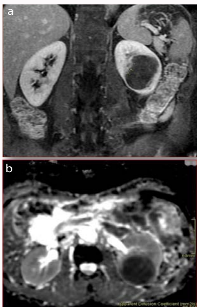
Figure 2: a) A Coronal image of T1 contrast-enhanced MR. A nodular thickening of the wall, suggestive of Bosniak IV cystic lesion is represented. b) An axial image of diffusion section (ADC) MR marked restriction of diffusion is observed which is characteristic of epidermal lesions.

the last 5 years (Figure 4). Adjuvant treatment has not been required.