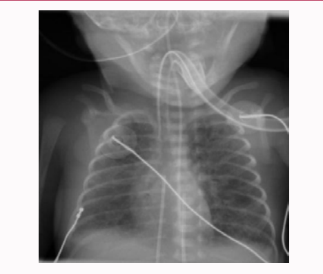
Figure 2: Chest radiograph on DOL 1, demonstrating early signs of pulmonary interstitial emphysema in the left lung.