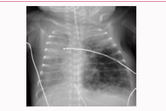
Figure 3: Chest radiograph on DOL 15, demonstrating worsening PIE with significant gas trapping noted in the left lung.

(Figure 4). The baby was placed on HFJV with low background conventional support. After 24 h of SBI, the PIE had resolved and the right lung had been reinflated. The endotracheal tube was retracted to its original position for resumed ventilation of both lungs. After reinitiating dual lung ventilation, subsequent chest radiographs showed improved aeration of the left lung with near resolution of PIE. The baby had decreasing ventilator and FiO<sub>2</sub> requirements with no recurrence of PIE seen on follow-up chest radiographs (Figure 5). At 35 days of age, HFJV was discontinued.