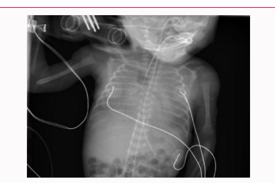
Figure 1: Chest radiograph within 1 hour of birth, demonstrating premature lungs with signs of RDS.